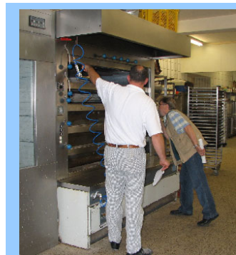
German E-Checkers visiting the bakery Tebart in Sonsbeck, Germany.