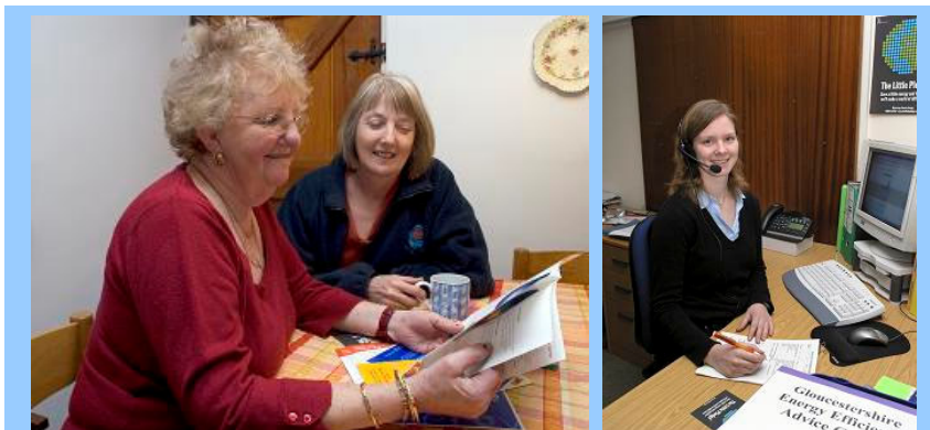
Staff from Gloucestershire Energy Efficiency Advice Centre (UK) giving advice in a clients home and by telephone.

Moving from analysis to action, the 8 project partners will also