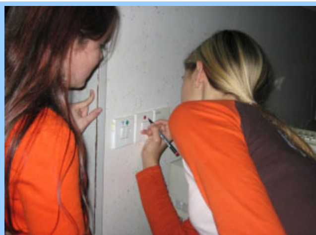
Energy detectives at work in school (Slovenia)

Finally, not every school department is immediately enthusiastic about the idea of energy education. The FEEDU team therefore had to pay attention to, and work closely with, the public authorities in charge of school education. Some